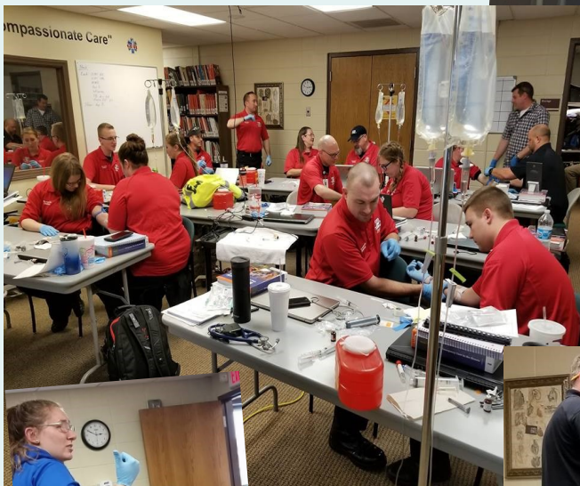
(L) IV start Class