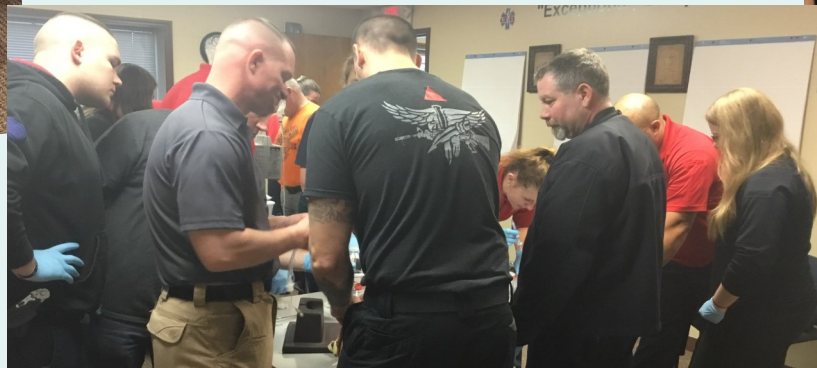
Combat Medic Class